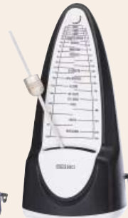
SPM320 Black (B)