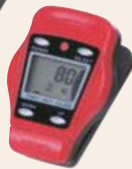
Red Metallic (R)