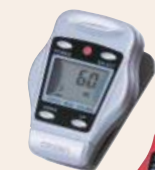
Silver Metallic (S)