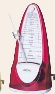
SPM370 Translucent Red (SR)

Compact metronome with clear, loud sound