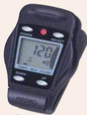
Blue Metallic (L)